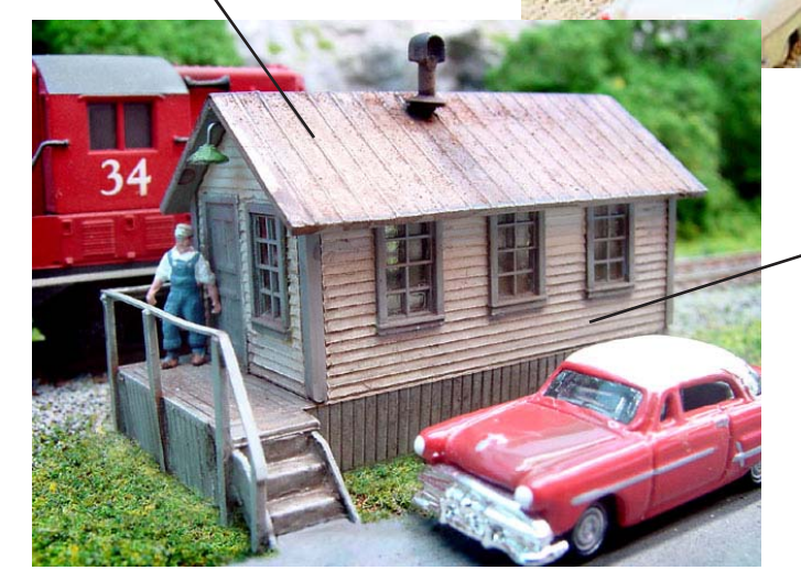
Black Wash Highlights Siding